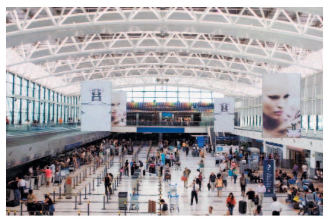
Lightweight structures for security areas in airports

Von Roll provides easy-to-build, lightweight assemblies consisting of ballistic materials that offer protection in accordance with the three classes defined by the French police authorities (Bureau des Affaires Immobilières de la Police Nationale, BAIPN).