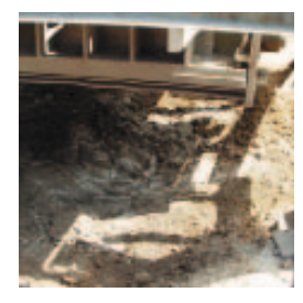
Von Roll blast floor panel AFTER explosion