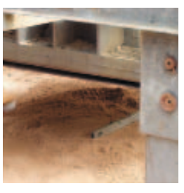
Von Roll blast floor panel BEFORE explosion