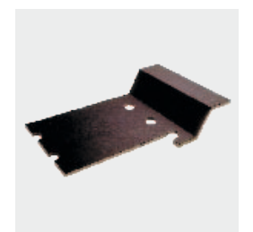
Vehicle floor spall liner