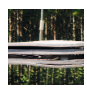
Close-up of Von Roll blast floor panel limited bulge AFTER explosion