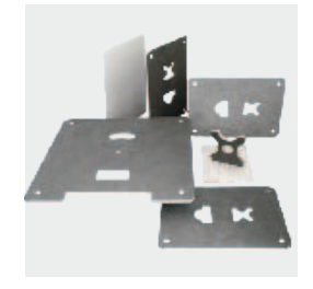
Vehicle side wall spall liner